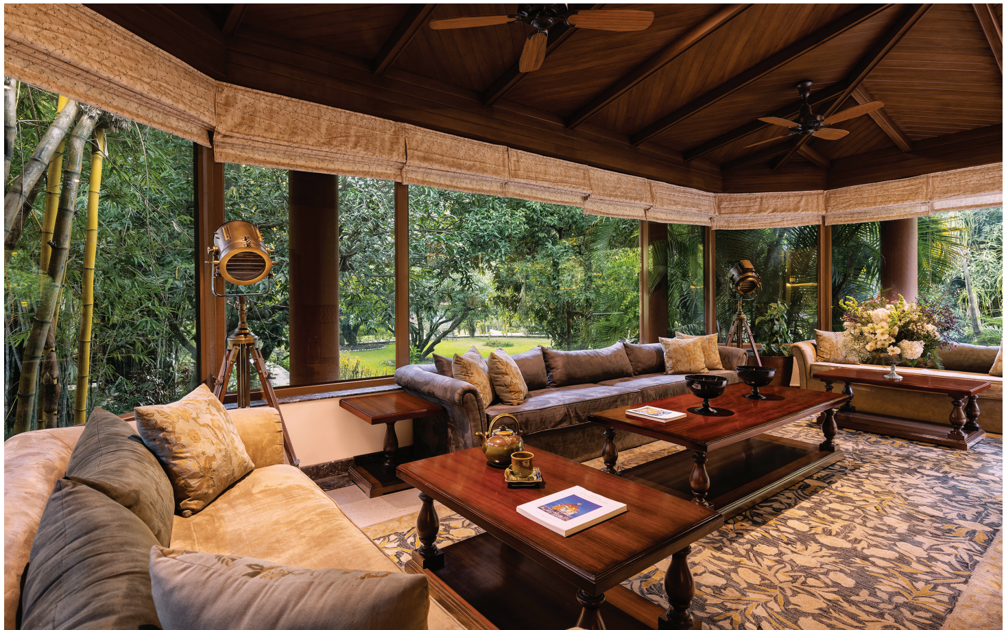
➤ Hotel rooms are carefully crafted with utmost cosiness, along with energy-efficient lighting systems, water-saving fixtures, and renewable energy sources.

Exciting additional amenities not only help yield revenue but also lead to a strong hotel presence, which