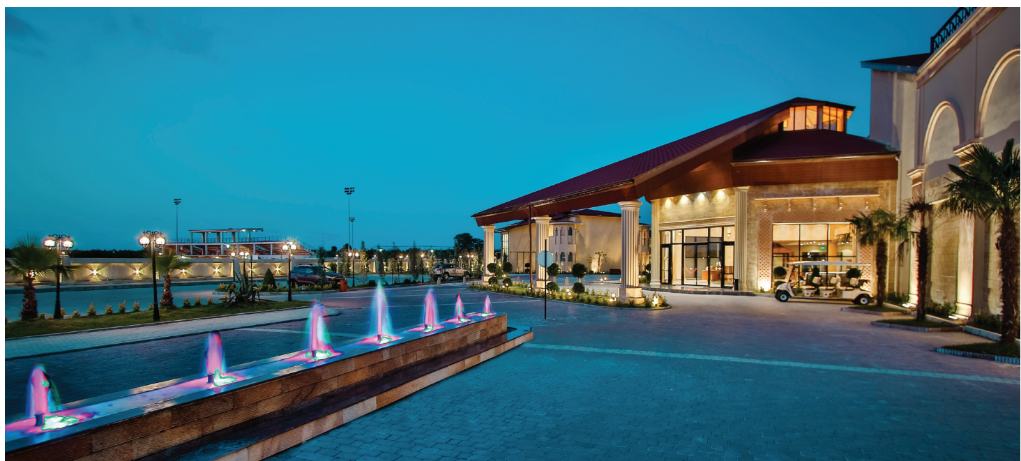
➔ With lush outdoor views to soothing lake views, hoteliers have left no stone unturned while maximizing their site use.