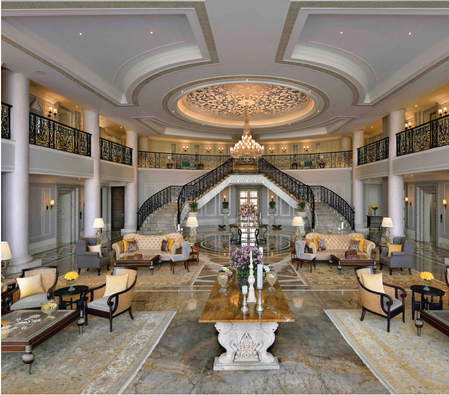
➔ Hoteliers and architects work together to design spaces that optimize guest flow, enhance staff productivity, and minimize operational costs.

therapies based on different body types. We provide the opportunity to enjoy a romantic high tea experience at Belvedere Point at our hotel, where they can savour delicious treats while taking in breathtaking views of the lake. To add an extra touch of elegance, we adorn the table with beautiful fabric and candles, creating a magical ambience. For those seeking a more enchanting evening, we offer dinner at our polo lawns, accompanied by live singers serenading the couples with melodious tunes. The lawns are thoughtfully decorated with soft lighting and an exquisite table setup. This creates a romantic atmosphere, perfect for a memorable dining experience.”