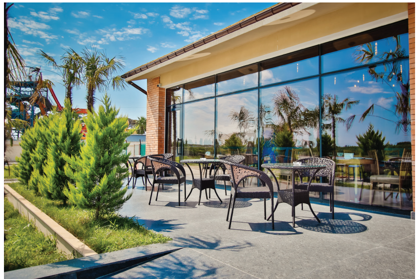
➔ F&B offerings contribute substantially to the overall income of the hotel, running parallel to room revenue.